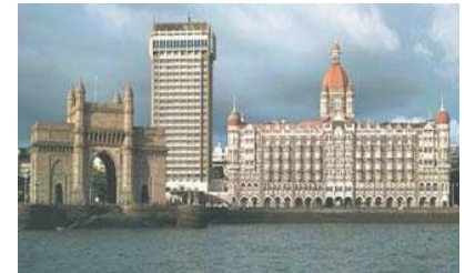
The Taj Mahal Palace, Mumbai

[Share your all kind of love desire for getting the Escorts in Jaipur to you at best rate now. I am all available to complete your all hot fun in New Delhi and alto give special hot love to you on out station as well. Come to me now]