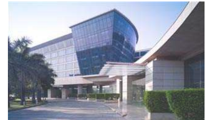
Hyatt Regency Mumbai

[Looking for educated and special class Independent Escorts Girls In Gurgaon to you to meet your all special class need then I am all available to complete your search in Gurgaon with cheap price, contact me now for girlfriend]