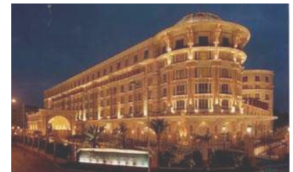
Itc Maratha Mumbai

[ Looking for all hot and special Independent Escorts to meet your all need and give the all total satisfaction to you in Chandigarh that you are looking to have fun on demand, that you are looking to have the all fun]