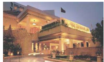
JW Marriott Mumbai Juhu